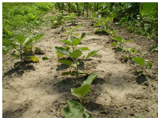
Fig. 1a. Brinjal in Civit ( Swintonia floribunda ) plantation

1-2 feet distance area. Similar type results were also observed by Dhukia et al. (1988) who found that closer plant from tree base has severely affected by root competition.