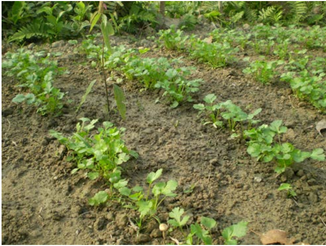
Fig. 1c. Coriander in Civit ( Swintonia floribunda ) plantation

Fruit size: Fruit size of both brinjal and tomato were significantly influenced by increasing distance from Swintonia floribunda sapling basal area (Table 1). Among