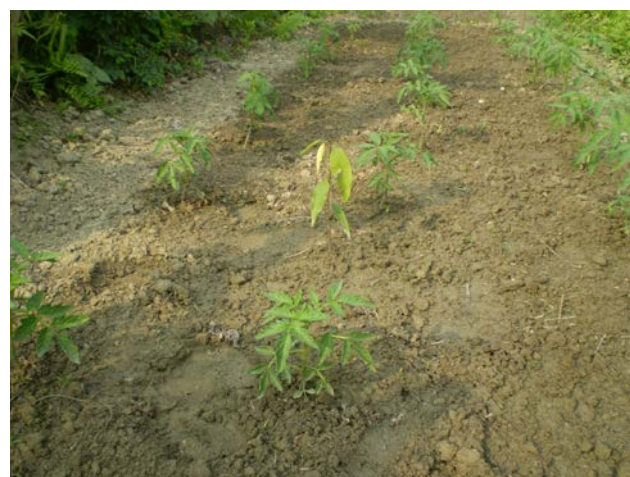
Fig. 1b. Tomato in Civit ( Swintonia floribunda ) plantation

No. of fruits per plant: Effect of Swintonia floribunda saplings on fruit setting of brinjal and tomato were also significant with increasing distance from sapling basal area (Table 1). Like plant height similar trend of variation was observed in case of fruit setting where highest numbers fruit were obtained from control condition and lowest at 1 feet distance from saplings base. No. of fruit per plant in brinjal and tomato at 3 and 4 feet distance from saplings base were statistically similar with control condition. Fruit setting was almost similar at 1 and 2 feet distance areas from sapling basal areas but numerically it was higher in 2 feet distant areas from basal area. So, it is clear that near the saplings base i.e. closest to the saplings there was a competition for moisture and nutrients between the roots brinjal, tomato and Swintonia floribunda , as a results fruit setting within 1-2 feet from sapling base was lower compare to 3-4 feet distance area. Similar result was also reported by Ali et al. (1998) who observed that fruit setting of okra was gradually increased with increasing distance from the trees.